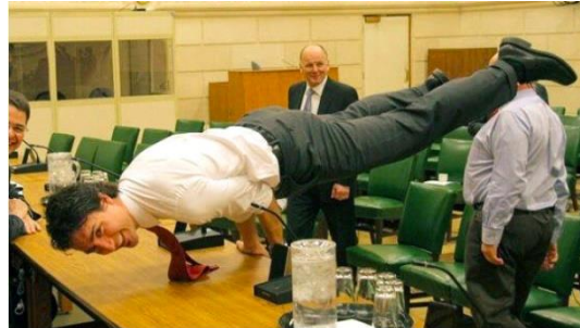
Figure 6. Justin Trudeau Doing Yoga Pose from Source: News et al. (2016)