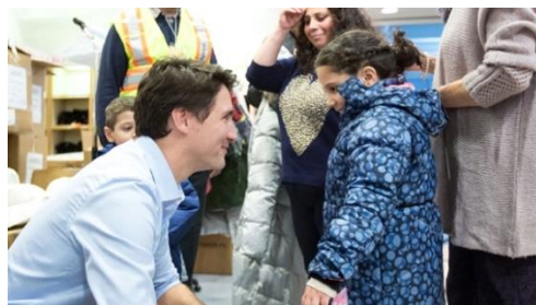
Figure 2. Prime Minister of Canada on the arrival of Syrian refugees at Pearson International Airport

As the prime minister of Canada, Justin Trudeau has shown his authority and credibility in real works. Over the world, media often talk about him in both ways; how he works and how attractive he is. The authority that he adopts as a prime minister is shown by how he makes agreement about world's issues, especially the refugee crisis. He has the authority to open Canada's doors for Syrian refugees fleeing war and persecution. On December 11 th 2015, the Prime Minister welcomed Syrian refugees to Canada on Thursday night at Pearson International Airport. The Government of Canada itself has planned to resettle 25,000 Syrians refugees (News et al., 2016).