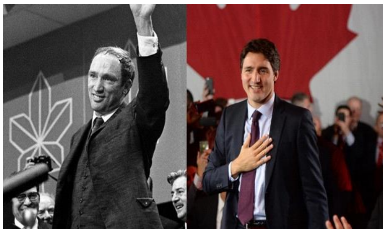
Figure 3. Pierre Trudeau and Justin Trudeau