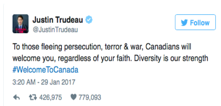
Figure 1. Justin Trudeau's Tweet

Canada has hardly been a leader in openness amongst countries. The number of refugees among developing nations, judged per capita, ranked a laggardly 20th. Nearly half of those refugees were privately supported by individuals, not by the government itself (Lukacs, 2017). His concern on the refugee crisis has captured the world about how refugees should be treated. He welcomed those fleeing war and persecution on Saturday, January 28 th 2017. Day after The United States in pointed tweets Trudeau said that refugees are welcome in Canada, President Donald Trump put a four-month moratorium on allowing refugees into the United States and temporarily banned travelers from seven countries (Ljunggren & Paperny, 2017).