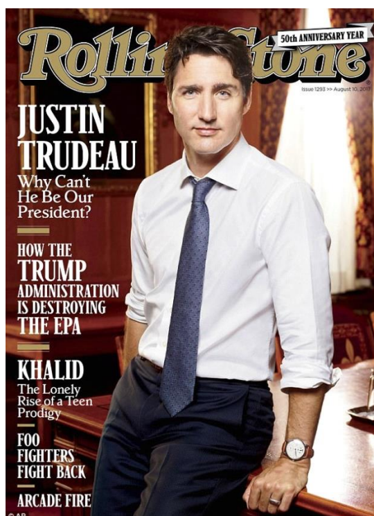
Figure 9. Justin Trudeau in Rolling Stone Cover

The latest update on Justin Trudeau is when Rolling Stone puts Justin Trudeau on the cover of the August 2017 edition by Rodrick (2017) emphasizes, "And yet, we are half a world away. Join me as we visit a nation led by a man who wore a Hitchhiker's Guide to the Galaxy T-shirt on national television, rode a unicycle and welcomed 40,000 Syrian refugees with open arms."