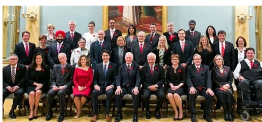
Figure 5. Canadian Prime Minister, Justin Trudeau has Named a Gender Equal Cabinet from Source: Frisk (2015)