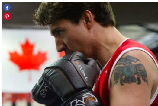
Figure 8. Justin Trudeau's Tattoo

The latest update on Justin Trudeau is when Rolling Stone puts Justin Trudeau on the cover of the August 2017 edition by Rodrick (2017) emphasizes, "And yet, we are half a world away. Join me as we visit a nation led by a man who wore a Hitchhiker's Guide to the Galaxy T-shirt on national television, rode a unicycle and welcomed 40,000 Syrian refugees with open arms."