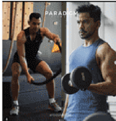
Figure 3. Instagram post @paradigmfitnessindonesia on January 2, 2022

Posts related to Public Relations and Publicity on Instagram @paradigmfitnessindonesia are shown by postings that bring up public figures who are concerned about body appearance.