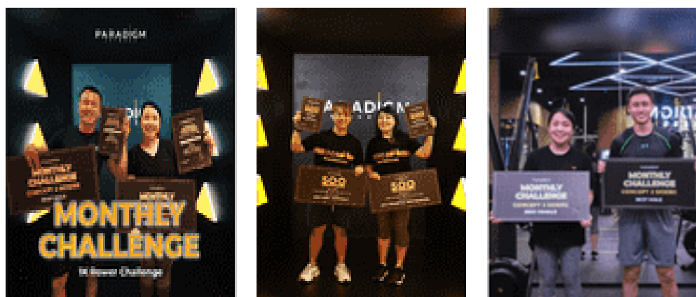
Figure 6. Instagram post @paradigmfitnessindonesia on January 21, 2022 (left), February 9, 2022 (center), March 1, 2022 (right) Source: Instagram (2022g); Instagram (2022d); Instagram (2022i)