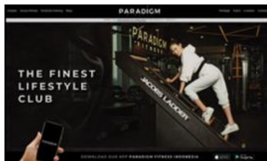
Figure 1. Paradigm Fitness Indonesia Website Appearance Source: Paradigmfitnessindonesia.com (2022)