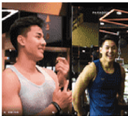
Figure 5. Instagram post @paradigmfitnessindonesia on March 20, 2022 and June 12, 2022

Figure 5 shows the man figure who appears, namely Matthew Gilbert, the 1st Runner-up L-Men of The Year 2021 and the representative from Indonesia at the Mister Supranational 2022 event in Małopolska, Poland. Awareness of physical appearance is also raised through posts that reveal man figures with well-trained bodies. Through training at the fitness center, men not only get satisfaction in taking care of themselves and getting the body they want. But they also make efforts to care for the body as part of a body fitness competition. Based on Figures 3, 4, and 5 that have been shown, Paradigm Fitness Indonesia brought up posts involving public figures from pageants, both man and woman. In this study Paradigm Fitness Indonesia, these figures are seen as capable of persuading the public to follow the lifestyle of exercising in the fitness centre.