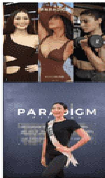
Figure 4. Instagram post @paradigmfitnessindonesia On January 2, 2022 and May 27, 2022